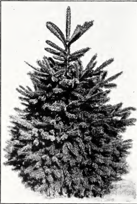
BLACK HILLS SPRUCE

For Windbreak planting we have a cheaper grade, all good trees, but not perfect in shape.